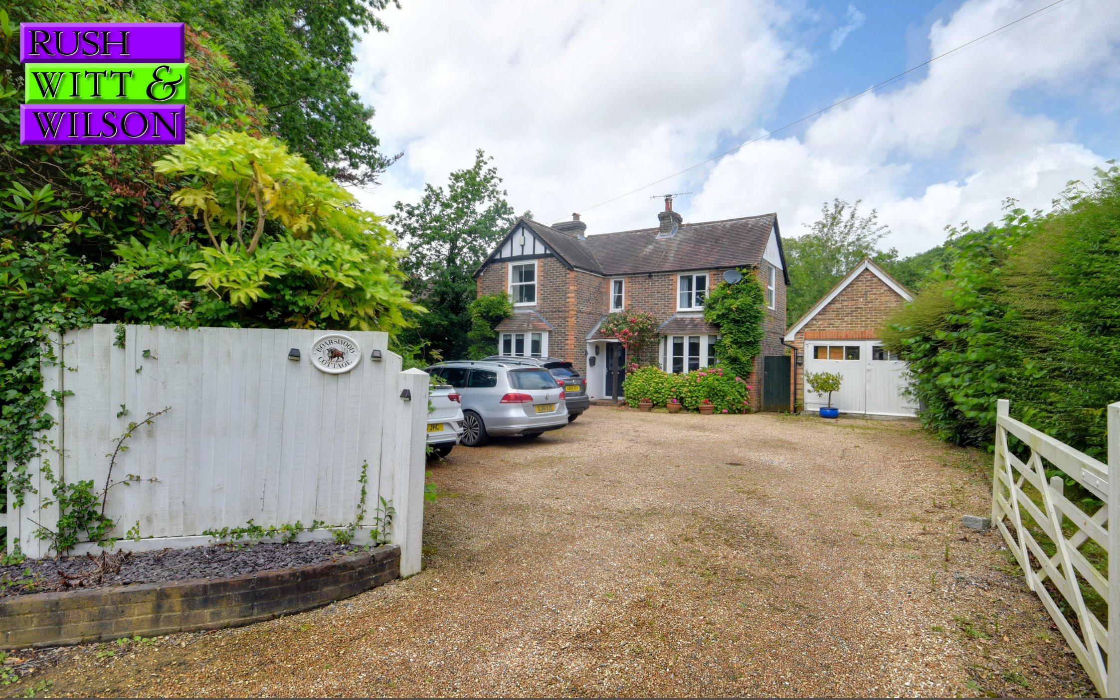
Boarswood Cottage, Barnets Hill, Peasmarsh, East Sussex, TN31 6YJ. £669,000 Guide Price